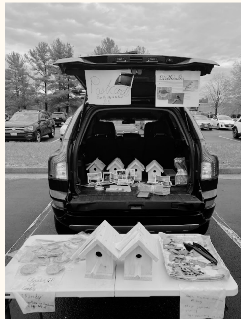
BIRDHOUSES AND POSTCARDS FOR SALE, CRAFT FAIR 2022

It's fun to sell things that you made to people, to drink hot chocolate, and hang out. While you are buying presents for people you care about at the Craft Fair, you are even more importantly helping to buy gifts for people who may not have that luxury. These are students our age in our own community. It's a great cause, so come to the Craft Fair!